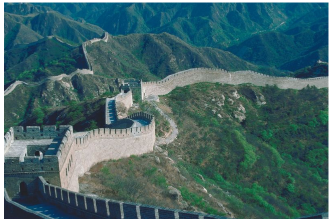
Great Wall of China